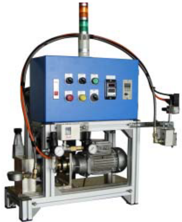
▲ JL300- fed by pneumatic pump