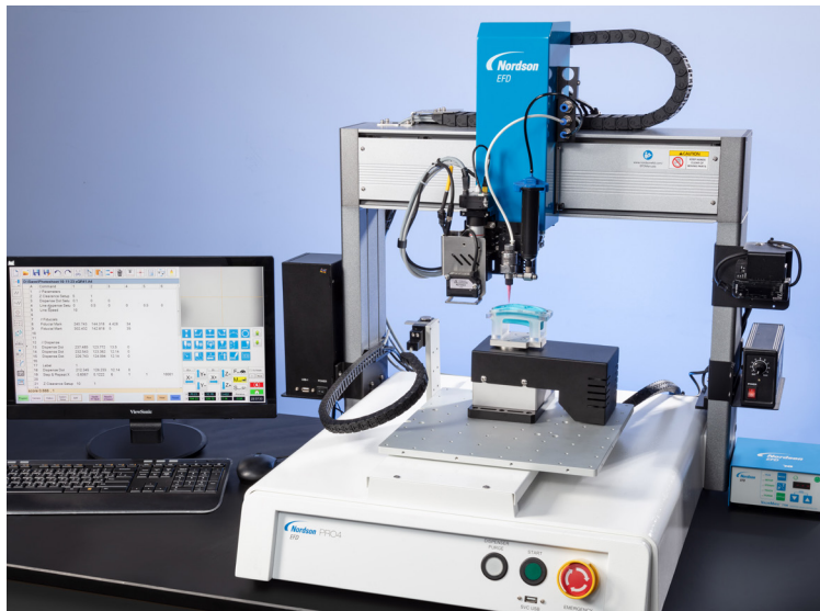
Removable rotating table allows for both 4-axis and 3-axis applications.

Easy 4-axis automation with a rotating table for longevity and application versatility