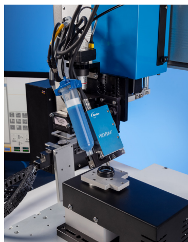
Fixed head creates less wear and tear with the rotating table.