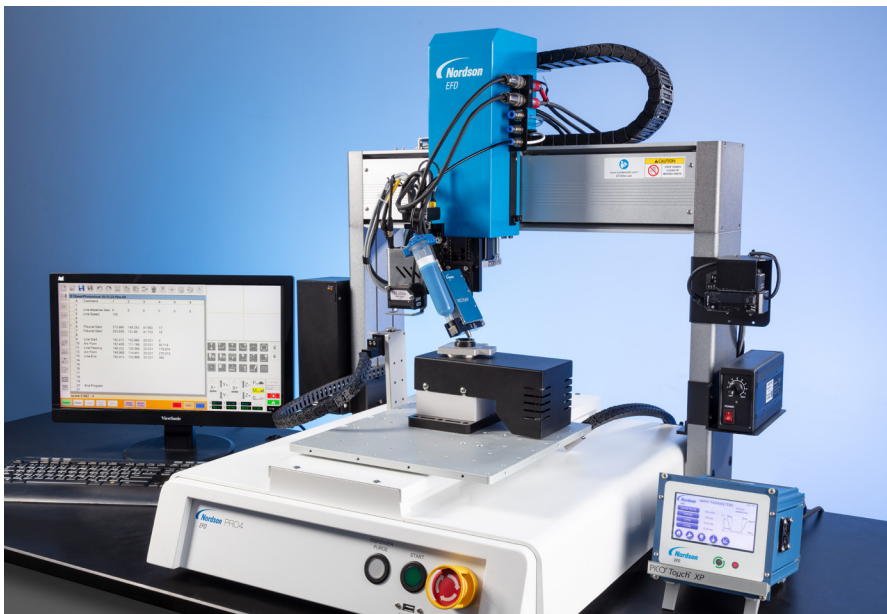
Integrated vision and laser make the 4-axis PROPlus Series a complete automated solution.