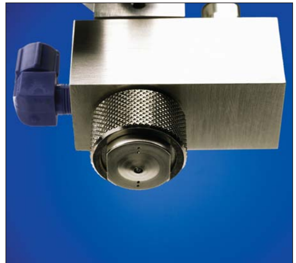
Spray nozzle with specially designed stem to prevent curing of the adhesive.